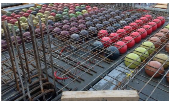
Figure 3 - View of the BubbleDeck structural system Below is the calculation of the reinforced concrete floor (Table 1)