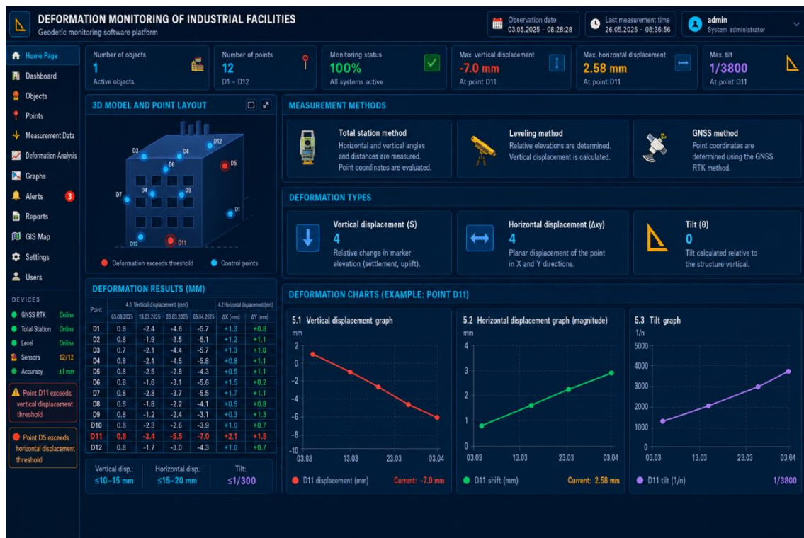
Fig 3. Deformation Monitoring of Industrial Facilities

In practical terms, the platform allows surveyors, engineers, technical supervisors, and facility management to work in a single information space.