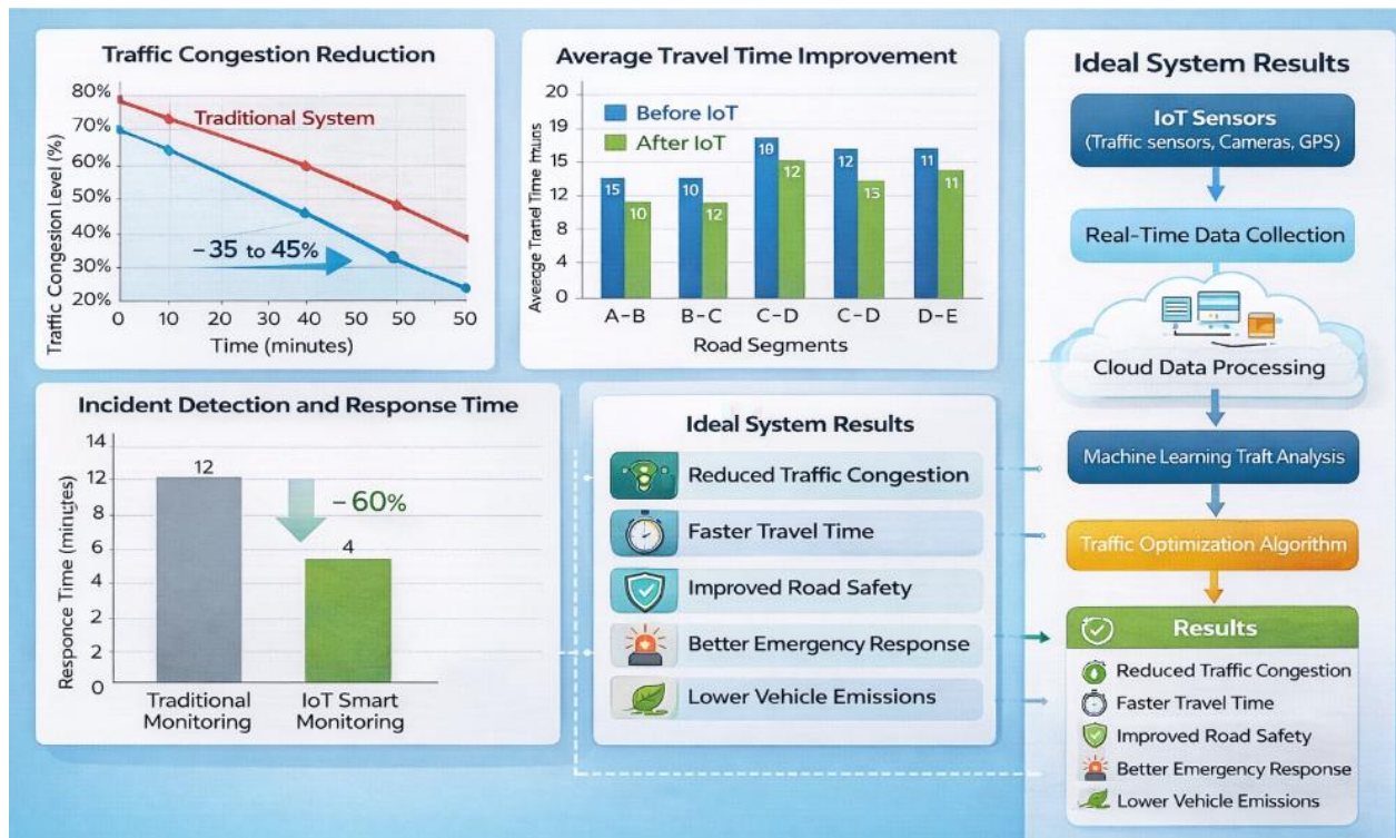
Fig.3. Results of Reducing congestion and enhancing security for Smart Cities using IoT Sensor Networks and Real-Time Data Collection